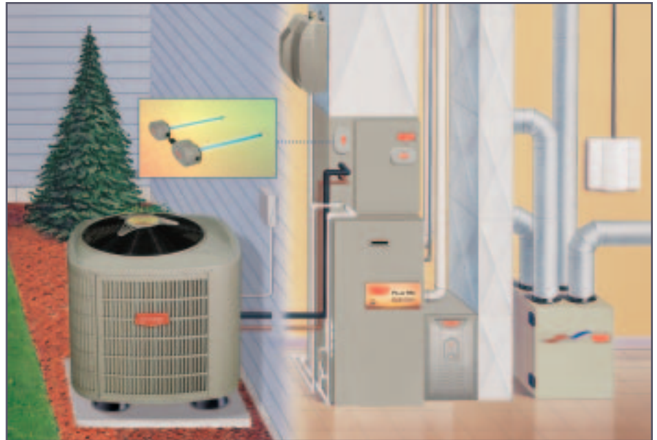
HYBRID HEAT™ Deluxe Heat Pump and Deluxe Gas Furnace System