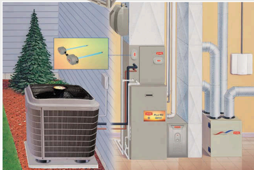
HYBRID HEAT™ Deluxe Heat Pump and Deluxe Gas Furnace System